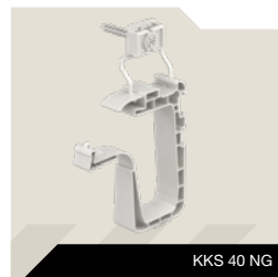
KKS 40 NG