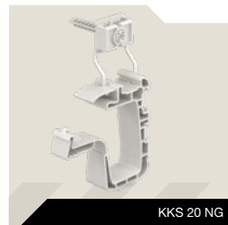
KKS 20 NG